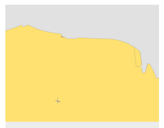
Contour of the mould insert to be WireCut with Fikus Visualcam